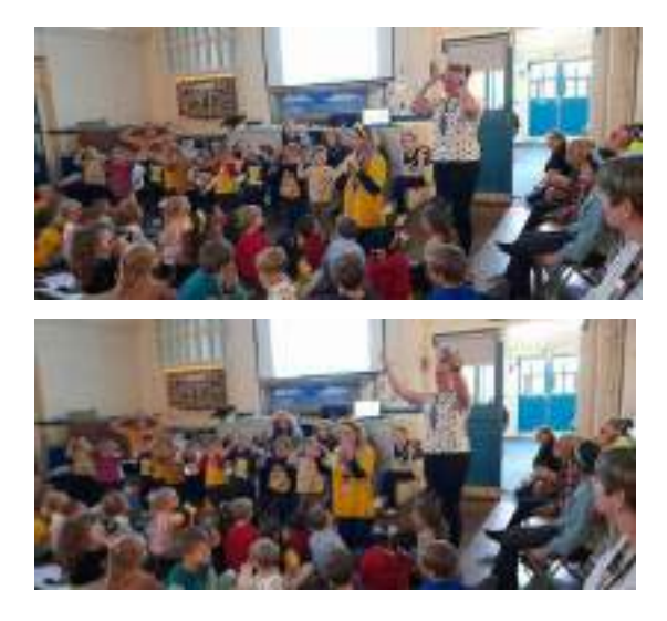
Nursery showed us how to make the sign for 'respect' in Makaton. They also made a kindness heart on World Kindness Day.