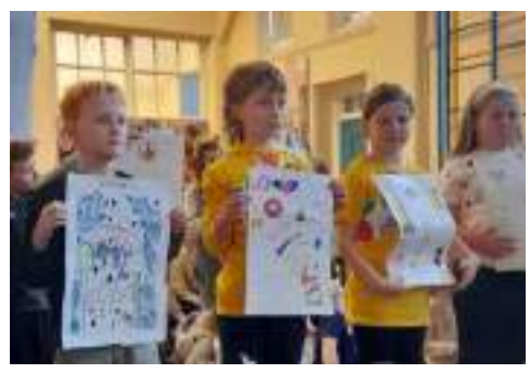
Year 5 and 6 treated us to poems, the ultimate definition of respect and some beautiful artwork.