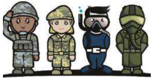
Applegarth Little Heroes Club

In 2024 The Service Children's Champion will be hosting their first ever 'Service Children Awards'. The aim is to recognise and celebrate the achievements and contributions of Service children and those who work hard to support them here in North Yorkshire. There are a range of categories some specifically for children, others for organisations/adults. There will be a judging panel who will select the winners of each category at the end of March. Nominations are open now